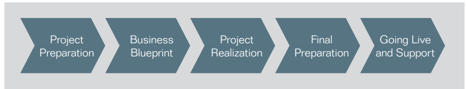
Figure 2: Five Phases of the Accelerated Implementation Methodology

The five phases of the methodology are described below.